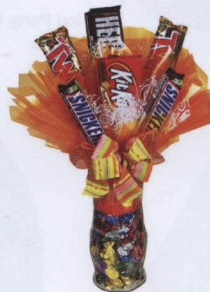
Deluxe Tall Vase

Candy Bouquets are a fun alternative to flowers that won't wilt or fade. Perfect for the sweet lover! We offer candy arrangements for any occasion: Happy Birthday, Promotion, Valentine's Day or "Just Because" to name a few.