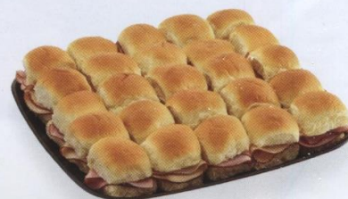
King's Hawaiian Sandwiches

Watermelon, honeydew, cantaloupe, pineapple, strawberries, green and red grapes with fruit dip. Medium tray serves 15-20. Large tray serves 25-30.