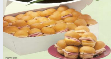
Sandwich Party Box