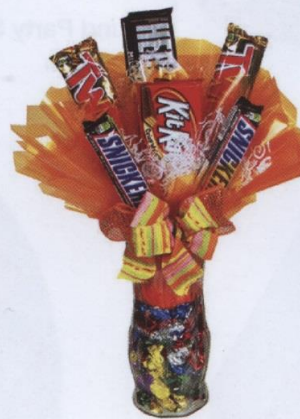
Deluxe Tall Vase

Candy Bouquets are a fun alternative to flowers that won't wilt or fade. Perfect for the sweet lover! We offer candy arrangements for any occasion: Happy Birthday, Promotion, Valentine's Day or "Just Because" to name a few.