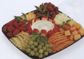
Fruit & Cheese

Southwestern dip, shredded lettuce, tomatoes, black olives and green onion, with taco style chips. Also available with meat. Serves 15-18.