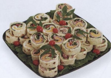
Variety Roll Ups

A combination of turkey, ham and roast beef roll ups. Serves 15-20.