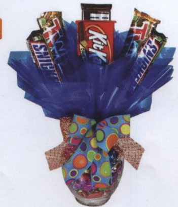
Mixed Chocolate Vase